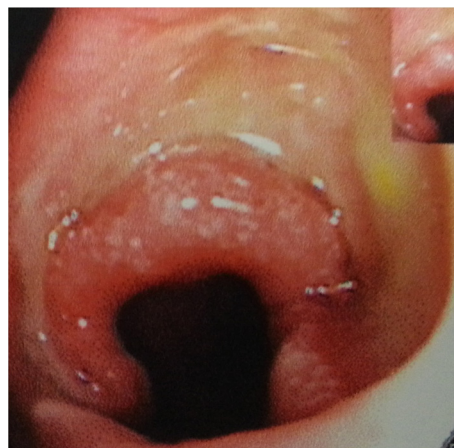
Figure 2. Upper gastrointestinal endoscopy after treatment.

essential thrombocythemia based on current evidence (2). In the current patient, clonal thrombocytosis was initially suspected. However, the current patient did not test positive for any MPN-related gene mutations. A profound increase in PLT subsided after upper gastrointestinal bleeding was appropriately diagnosed and treated. Thus, MPNs were ruled out in the current case.